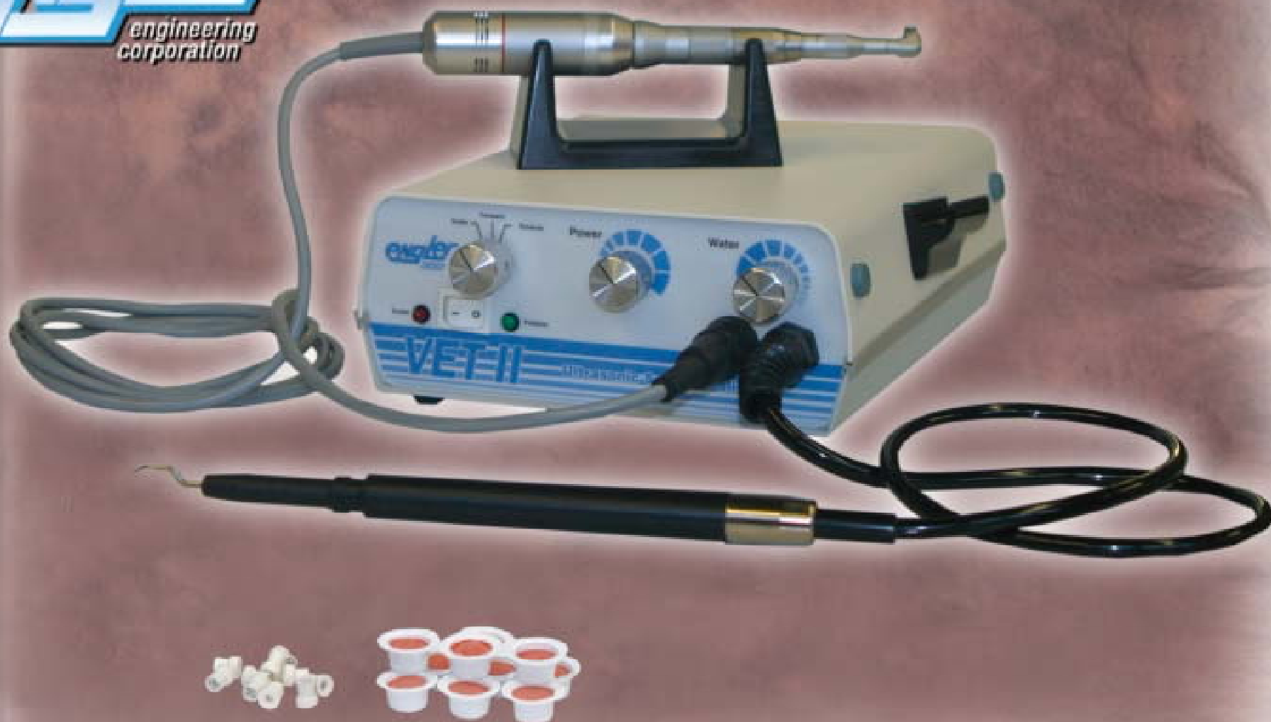
Vet II 25K Scaler/Polisher Combination