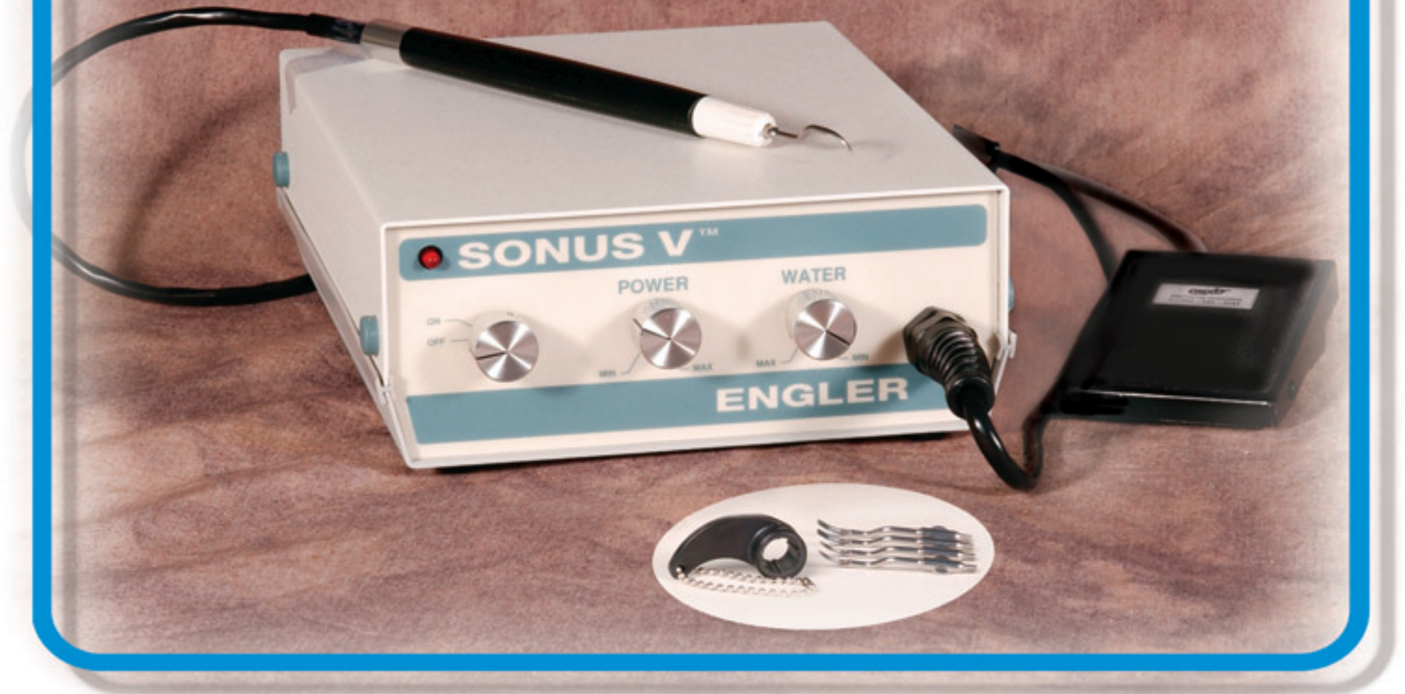
Sonus V Ultrasonic Dental Scaler