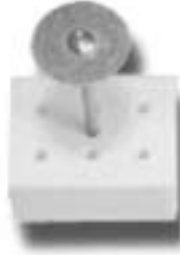
PART # P-129

DIAMOND COATED CUTTING DISC WHICH MAY BE USED FOR DENTAL AND OTHER SURGICAL CUTTING PROCEDURES. 2.35 MM SHANK DIAMETER WITH AN 18 MM HEAD DIAMETER. FITS DIRECTLY INTO STRAIGHT HANDPIECE. (AUTOCLAVABLE)