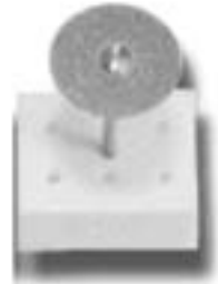
PART # P-130

DIAMOND COATED CUTTING DISC WHICH MAY BE USED FOR DENTAL AND OTHER SURGICAL CUTTING PROCEDURES. 2.35 MM SHANK DIAMETER WITH AN 22 MM HEAD DIAMETER. FITS DIRECTLY INTO STRAIGHT HANDPIECE. (AUTOCLAVABLE)