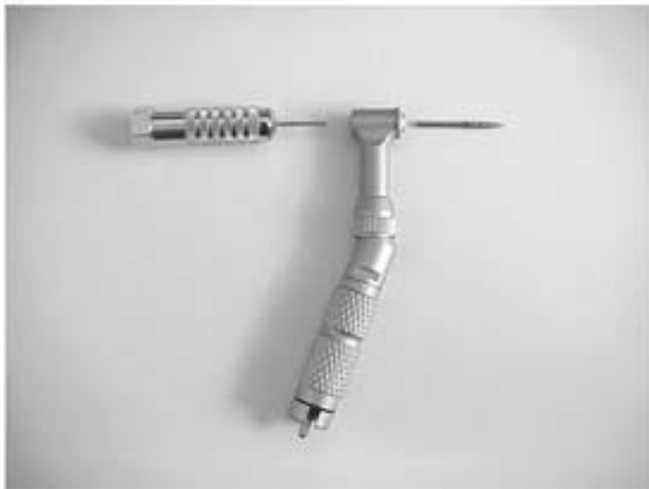
TO REMOVE BUR: PUSH PIN INTO CONTRA ANGLE HEAD, UNTIL BUR FALLS OUT.