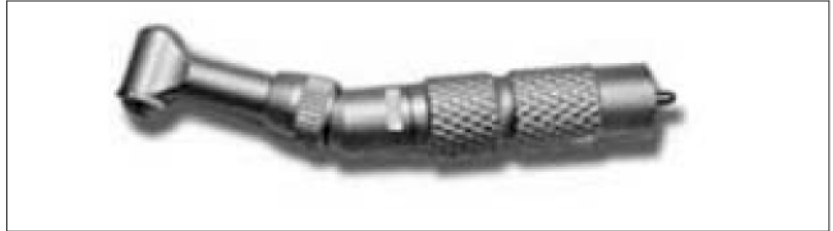
P-A3 F.G. Contra angle for handpiece