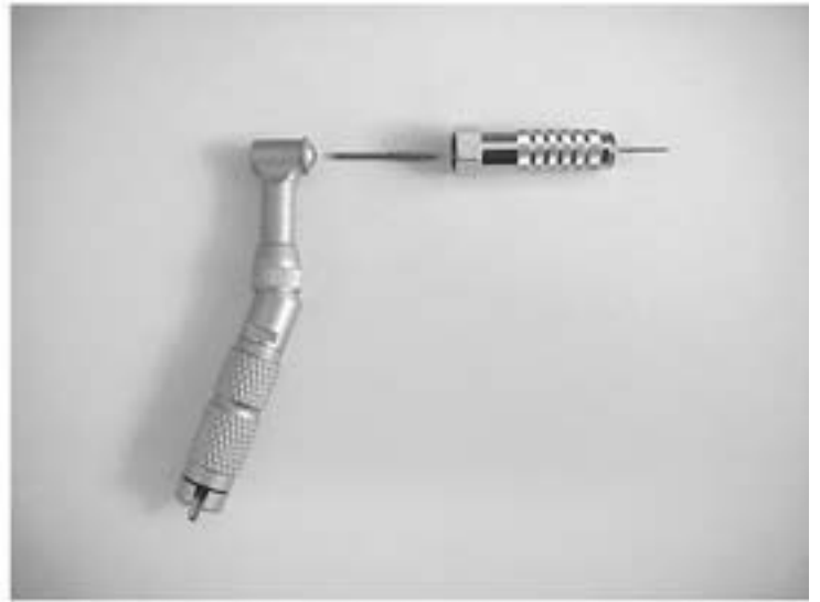
TO INSTALL BUR: INSERT BUR INTO HEAD CAP, USE RUBBER END OF TOOL TO PUSH BUR INTO THE CONTRA ANGLE HEAD.